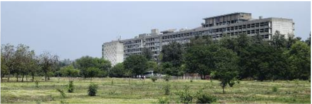
Ph. Cemal Emden