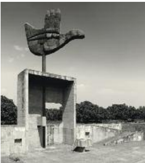
Ph. Cemal Emden