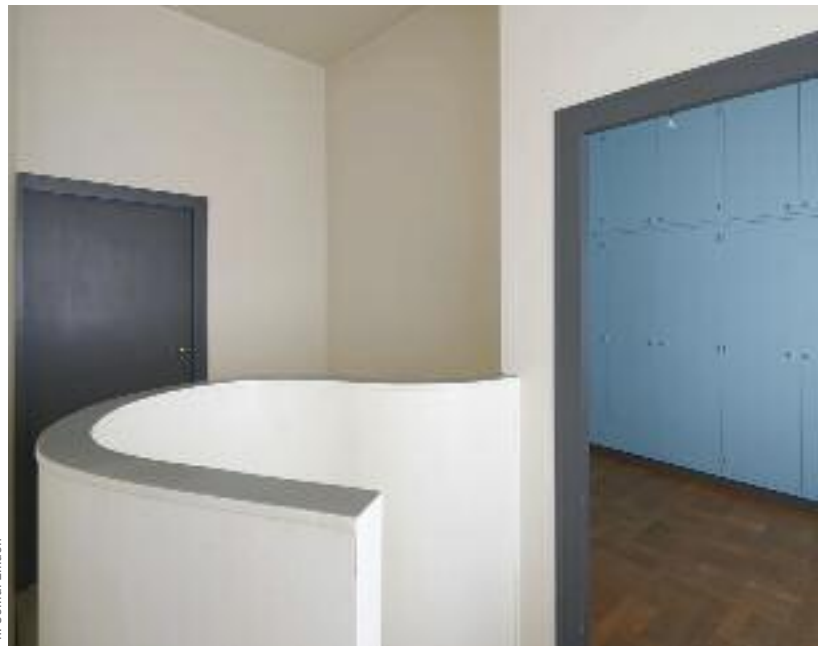
Ph. Cemal Emden