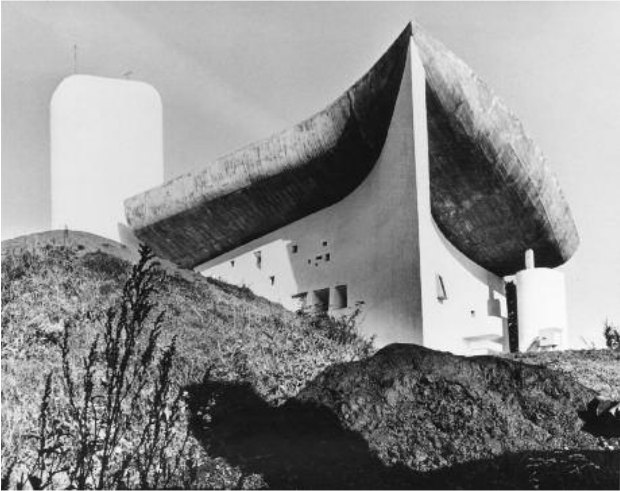
Chapelle Notre-Dame-du-Haut, Ronchamp.