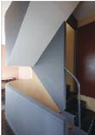
Maisons doubles de la Weissenhof-Siedlung, Stuttgart.

The experience of the International Committee, set up at the launching of the proposed candidature, guarantees the quality of work undertaken by the Standing Conference. Despite the vicissitudes of the application, solidarity and cooperation among the members have never been put in question, and the countries that were present in 2003 are all involved in this new application, thus demonstrating exceptional solidarity around the work of an architect.