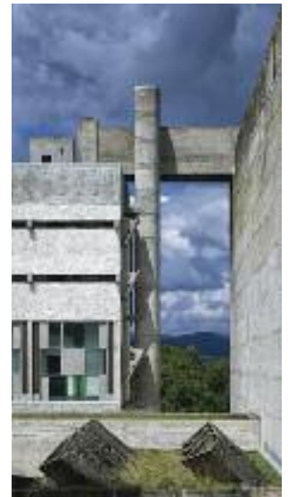
Couvent Sainte-Marie-de-la-Tourette, Eveux.

In this respect, The Architectural Work of Le Corbusier , with its exceptional level of integrity and authenticity, reflects much better the profound changes in twentieth century architectural creation than a mere adding-up of iconic achievements by great names of twentieth century architecture, with the elitist aesthetical approach that this implies.