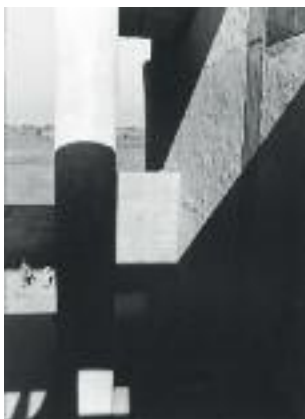
Haute-Cour de Justice, Chandigarh.

The Architectural Work of Le Corbusier exhibits an unprecedented interchange of human values and a remarkable debate of ideas, on a worldwide scale lasting half a century, on the birth and development of the Modern Movement. Faced with a world dominated by academicism, The Architectural Work of Le Corbusier revolutionized architecture by demonstrating, in an exceptional and pioneering manner, the invention of a new architectural language that made a break with the past. The Architectural Work of Le Corbusier marks the birth of three major trends in modern architecture: Purism, Brutalism and sculptural architecture. The global influence reached by The Architectural Work of Le Corbusier on four continents is a new phenomenon in the history of architecture and demonstrates its unprecedented impact. The influence of the buildings comprising this series is all the more powerful as The Architectural Work of Le Corbusier was further propagated by the architect's many writings, immediately disseminated and translated throughout the world. This unique complementarity between the built work and the publications made Le Corbusier the main spokesman for the new architecture and The Architectural Work of Le Corbusier a subject of endless observation, analysis and commentary as well as a worldwide source of either inspiration or constant opposition.