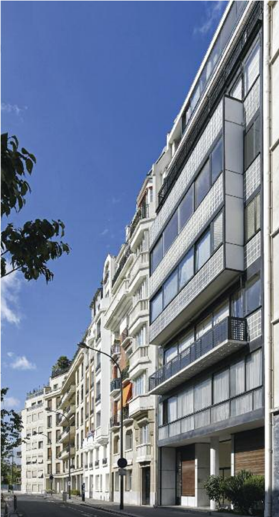
Ph. Cemal Emden