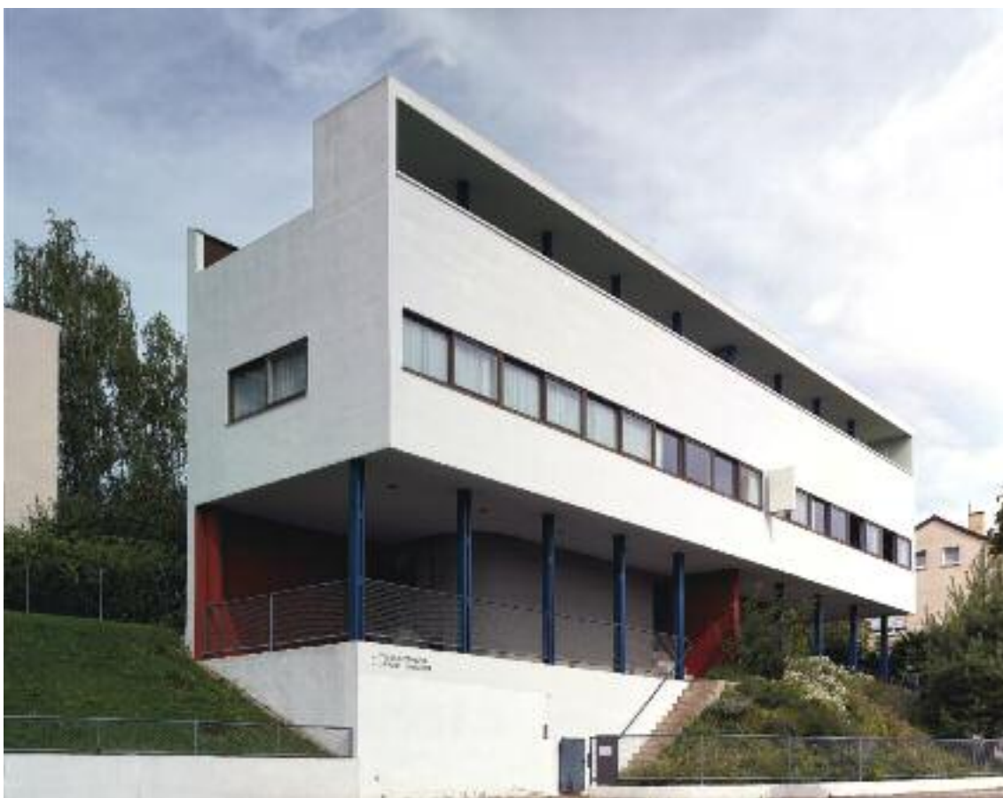
Ph. Cemal Emden