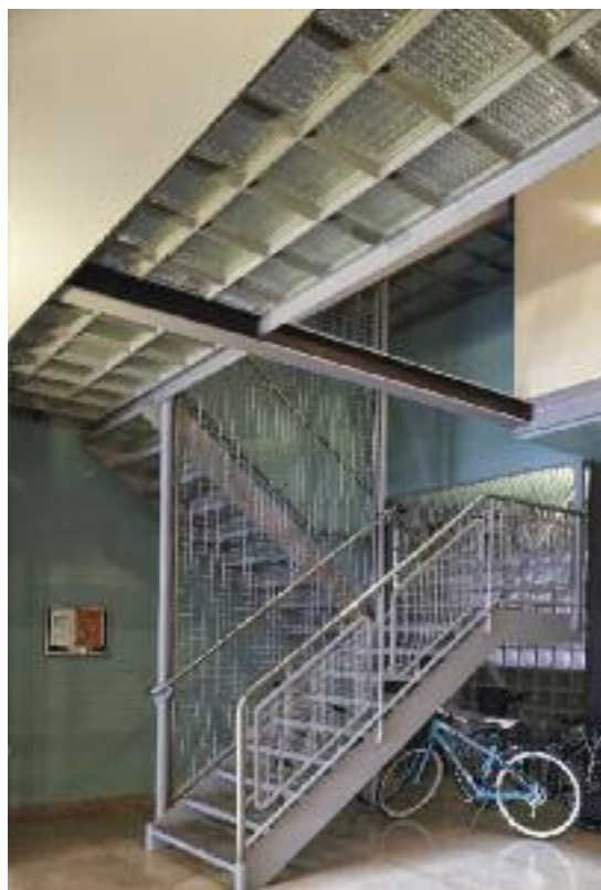
Ph. Cemal Emden