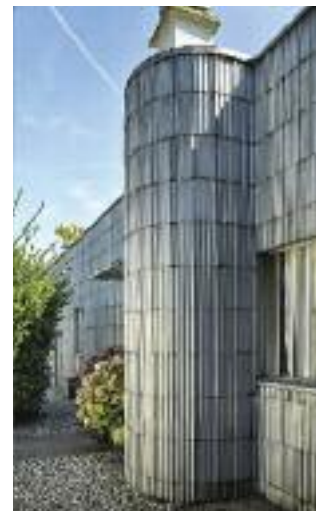
Petite villa au bord du Lac, Corseaux.

At the present time, they all display a high level of internal and external conservation. The forms, distribution, spatial composition, colour and materiality of the works present a high level of fidelity. Moreover, with few exceptions, these constructions have retained their original use, thereby favouring the proper care and maintenance of both the interior spaces and the facades. Many have recently undergone restoration campaigns based on extensive preliminary studies: these are Maisons La Roche et Jeanneret , Maisons de la Weissenhof-Siedlung , Immeuble Clarté , Unité d'habitation de Marseille , Couvent Sainte-Marie-de-la-Tourette , Maison de la Culture de Firminy . The environment of some elements in the series has changed since their construction but, on most sites, urban and landscape control procedures have been implemented or are under consideration.